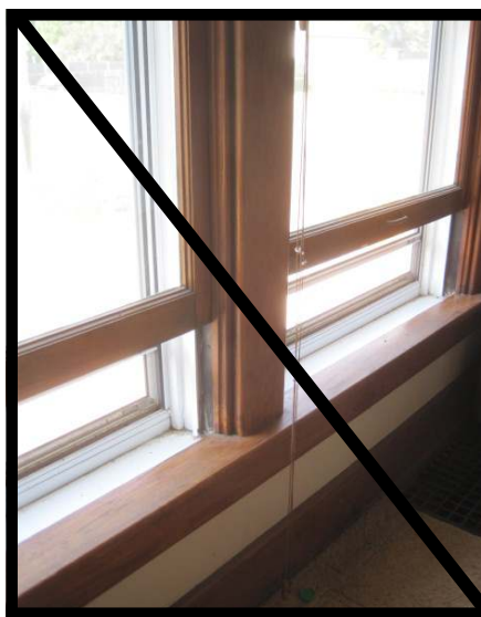
2. Drafty windows.

Note: Effective humidity control equipment, either for the home in general or the piano in particular, will aid in keeping your piano in top form.