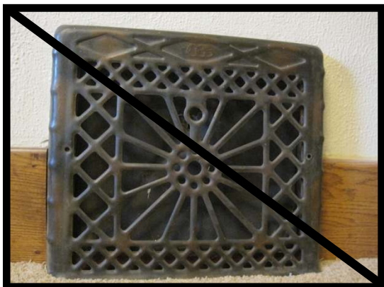
1. Hot air registers—dry, heated air blowing directly on the back of a piano is particularly bad for the soundboard.

Environment: While tuning, repairs, regulation and voicing are the job of the technician, seeing to it that your grand piano is placed in an appropriate spot within your home is up to you. What is needed, as much as possible, is a location where temperature and humidity are kept at moderate levels year-round. Drafty locations, or areas where wide swings in either temperature or humidity occur (unheated porches, moldy basements, etc.) are unsuitable for a piano. In particular avoid placing your piano in front of either of the following: