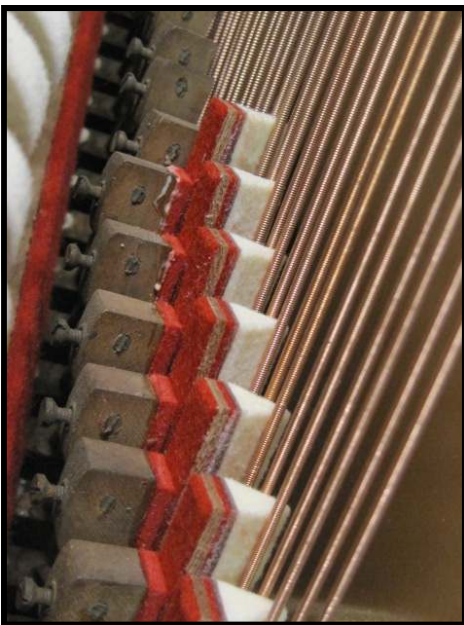
New bass dampers being installed.

The condition of the soundboard, the quality of the hammers and the integrity of the bass bridge all need to be factored in as well. Since these components influence the tone of not only the bass but also the piano in general, any suggested repairs should be considered to achieve the best results.