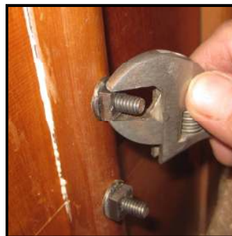
Toggle being tightened