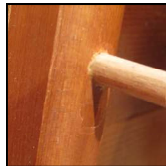
Dowel inserted in place.