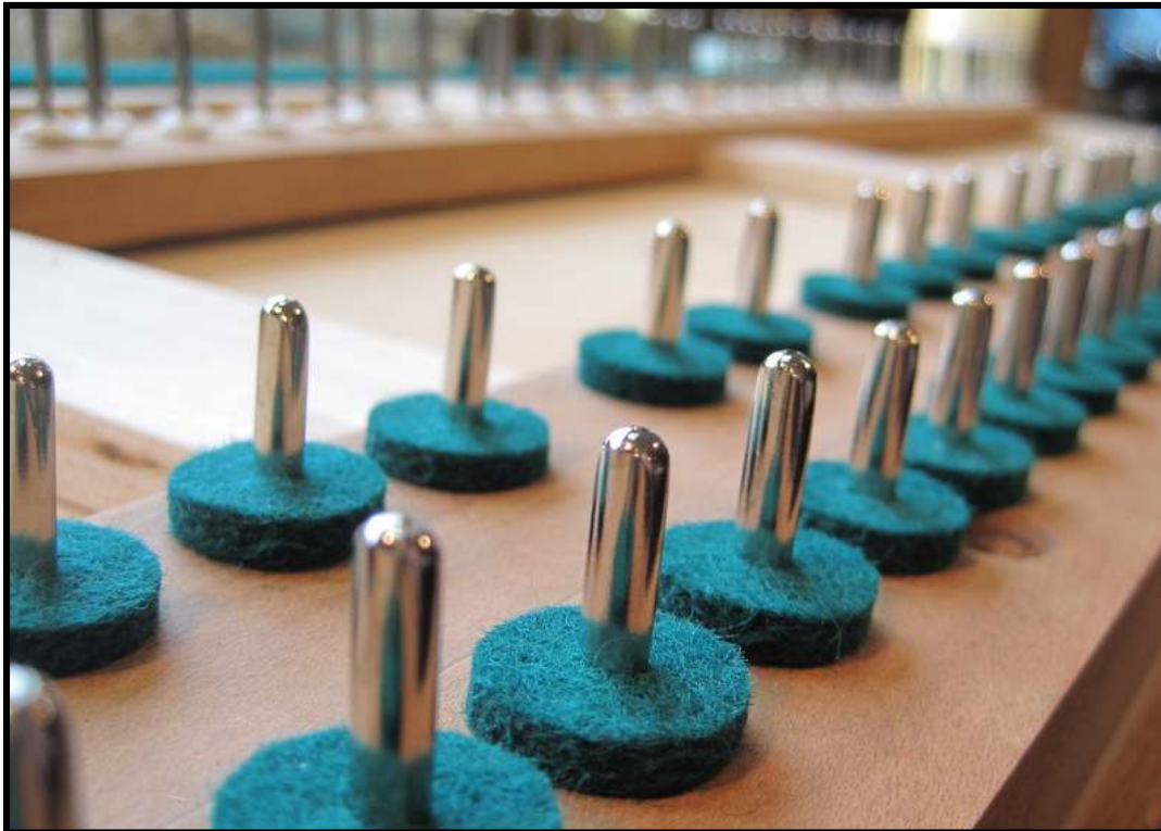
New set of keybed felts in place.

"In business to bring your piano to its full potential."