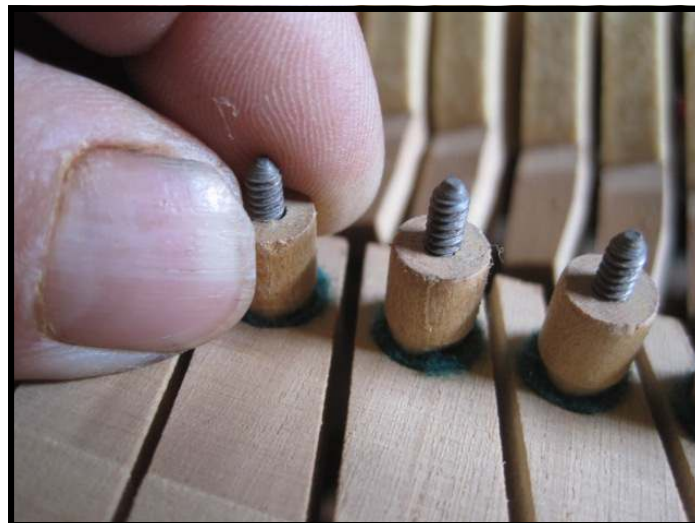
Adjusting lost motion with a fine touch.

At present, your piano is in need of adjustment as far as lost motion is concerned. Having the adjustment set correctly would improve the consistency of the touch of your instrument.